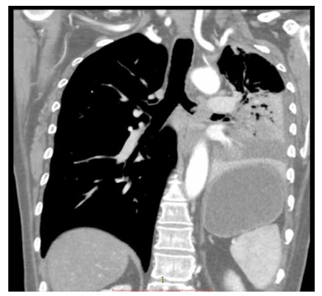
Figure 1. Computed tomography before operation

Due to the result, further oncological treatment had to be planned, as tumour resection was not radical. 18-FDG PET/CT scan did not show any spread of the cancer; 11 weeks after the resection, flexible bronchoscopy with autofluorescence was performed. In the medial area of the left bronchus wall, about 20 mm from the carina, a submucosal infiltration of about 15 mm, illuminating in autofluorescence imagining (AFI), was diagnosed; the distal section of the main bronchus free from infiltration was 7 mm.